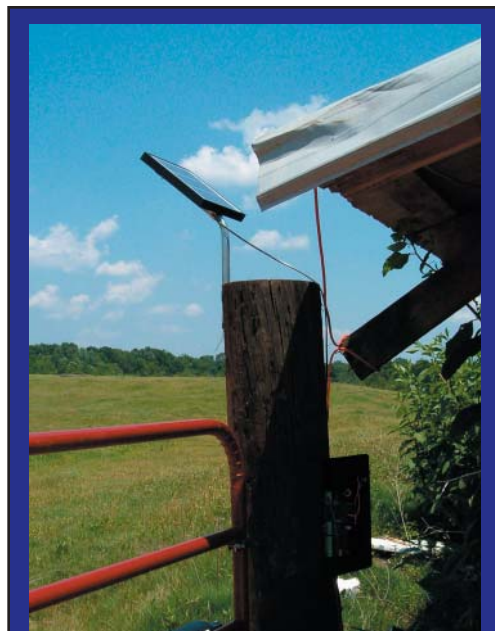
A close-up of one of the four solar-powered gate openers MDRS purchased to improve access around the farmstead.

“The Burkes represent Mississippi, AgrAbility, and farmers well as they are hard-working and determined,” said Jimmy. ♦